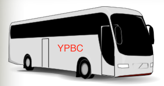
SHAW FESTIVAL THEATRE Niagara On The Lake Wed. Oct. 9, 2013 "Lady windermere's Fan" Lunch at the Prince of Wales $ 146.00